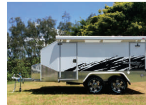
OFF ROADER PACKAGE