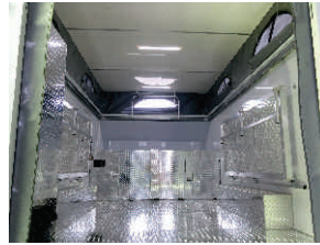
INTERNAL LINING & INSULATION