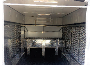
INTERNAL MESH LINING