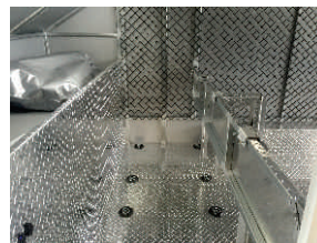
FLOOR TO TOP OF SHELF DIVIDER, SEPARATES BIKES FROM KITCHEN, FRIDGE & GEAR