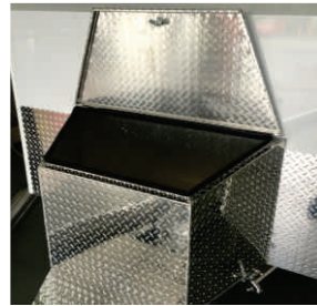
DRAW BAR TOOL BOX