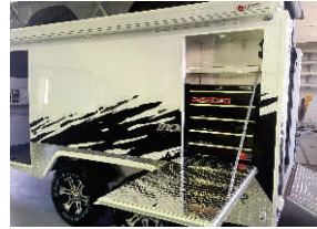
REAR SIDE DOOR CABINET & 5 DRAW TOOL BOX