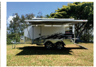
FIAMMA F45S AWNINGS