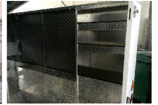
DRIVERS SIDE INTERNAL SHELVING UNIT