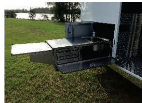
CAMP KITCHENS AND DURASLIDES