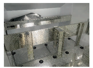
REMOVABLE SET BACK DIVIDER, PUSHES BIKES BACK TO CREATE WALK THRU ACCESS INTO TRAILER. WHEEL STOPS CAN BE POSITIONED ON SHELF OR DIVIDER