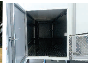
FRONT NOSE CONE ACCESS DOORS