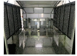
INTERNAL MESH LINING