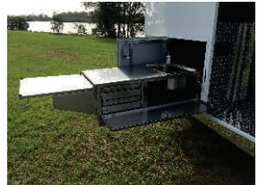
CAMP KITCHENS AND DURASLIDES