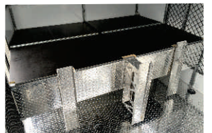
REMOVABLE FRONT DOUBLE BED ( only available on the 5 bike warrior )