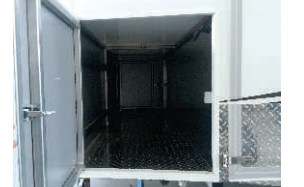
FRONT NOSE CONE ACCESS DOORS