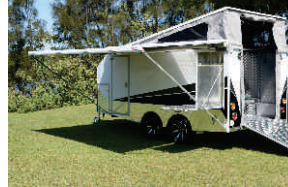
GREY CANVAS CAMP PACK