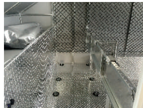
FLOOR TO TOP OF SHELF DIVIDER, SEPARATES BIKES FROM KITCHEN, FRIDGE & GEAR