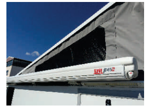
FIAMMA F45S AWNINGS