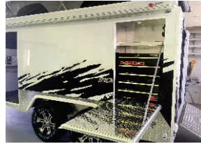
REAR SIDE DOOR CABINET & 5 DRAW TOOL BOX