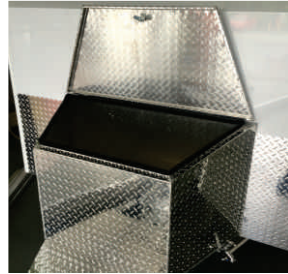
DRAW BAR TOOL BOX